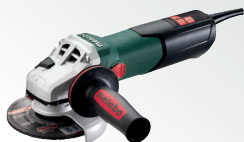
Electronic Variable Speed 4 1/2" / 5" Angle Grinder WEV 10-125