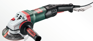
Electronic 5" Angle Grinder with Non-locking Paddle Switch, Brake, Auto-balance and Drop Secure WEPBA 17-125 Quick RT DS