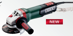
Electronic 5" Angle Grinder with Non-locking Paddle Switch, Brake, Auto-balance and Drop Secure WEPBA 17-125 Quick DS