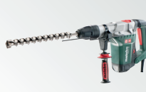
1 9/16" SDS-Max Hammer KHE 5-40