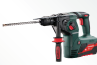
1 1/4" 36V SDS-Plus Hammer KHA 36 LTX