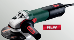
Electronic Variable Speed 6" Angle Grinder WEV 15-150 HT