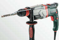
1 1/8" SDS-Plus Multi-Hammer UHEV 2860-2 Quick