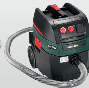
ASR 35 ACP HEPA Auto Clean HEPA Vacuum US602057800