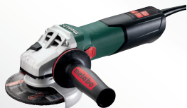
Electronic Variable Speed 4 1/2" / 5" Angle Grinder WEV 15-125 HT