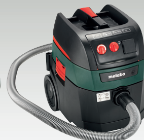
ASR 35 ACP Auto Clean Vacuum 602057420