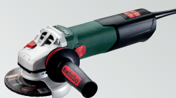
Electronic Variable Speed 4 1/2" / 5" Angle Grinder WEV 15-125 Quick